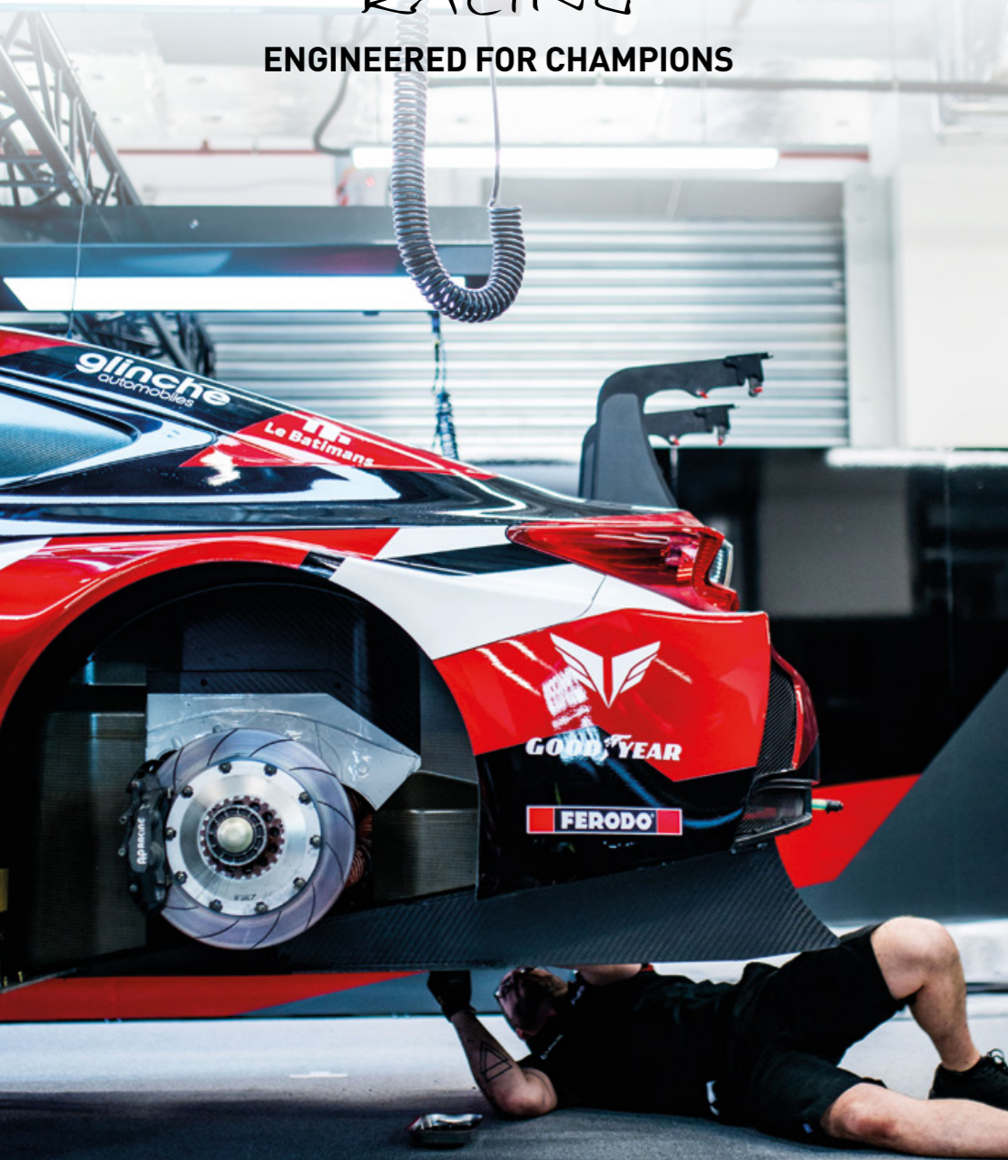
Akkodis ASP Team, WEC, FIA World Endurance Championship